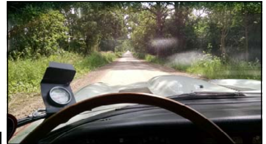
Testing the transmission

Have you ever noticed a loose wire behind your gauge console that is not connected? Try to figure out where that one is supposed to go. (They tell me its for fog lights that I don't have)