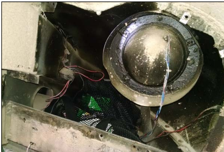
Panel removed behind headlight.

Just use a Philips head screwdriver to remove the panel behind the headlight and you're all set for repairs on the roadside if needed or running drugs across the border.