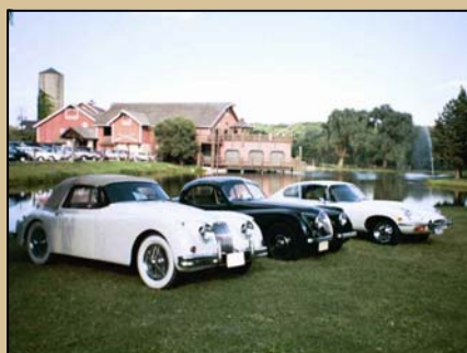
2001 Concours Fisherman's Inn

Sept 2nd: 50th Annual Michigan Concours Chuck Diamond 810-688-4168 concourchair@jagm.com