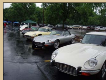
2006 Concours McDonalds