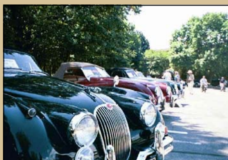
2003 Concours Lincolnshire